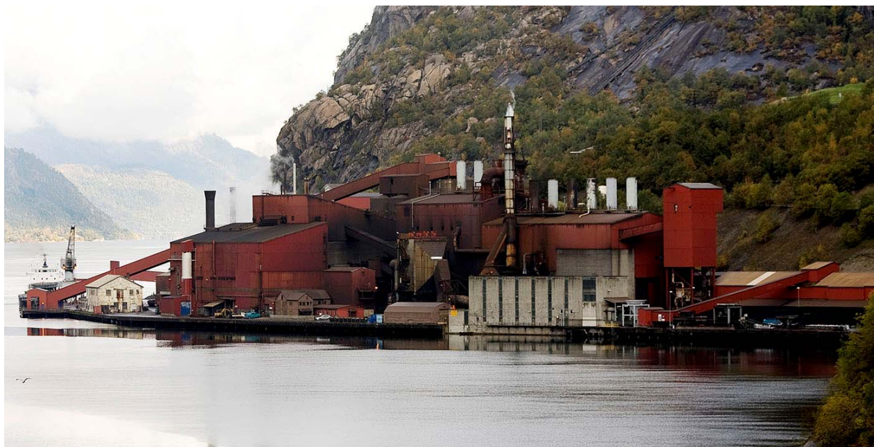
TiZir Titanium & Iron ilmenite upgrading facility, Tyssedal, Norway

Cashflow performance continues to improve with the working capital build now completed at TTI.