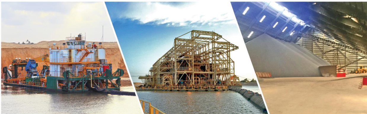
Grande Côte Operations, Senegal

Social responsibility activities for the quarter focused on school infrastructure projects and the installation of street lights and market stalls in the local community of Meckhe. Further, construction of a community market at Mboro is in progress and is scheduled for completion in 3Q 2017. Development of agricultural land for project affected people has begun, with the local community taking occupancy. Each agricultural plot is equipped with irrigation facilities and farming activities have begun with the assistance of GCO in collaboration with Agence Nationale des Éco-villages and the Forestry Department.