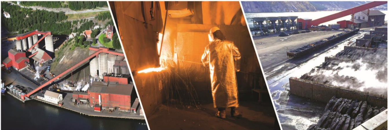
TiZir Titanium & Iron ilmenite upgrading facility, Tyssedal, Norway